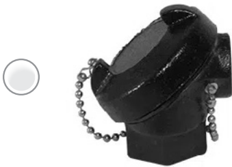
Epoxy Coated Aluminum