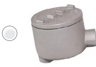
Cast Aluminum Explosion Proof