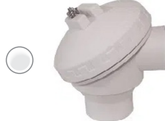
FDA Compliant Plastic