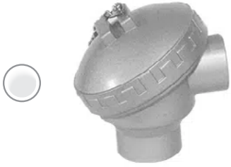
Large Cast Aluminum